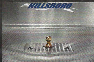
OPTIONAL HILLSBORO B&W CONVERSION KIT