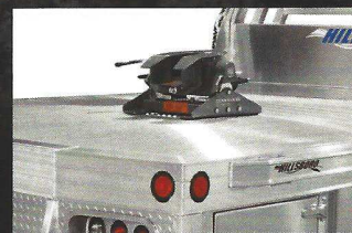
OPTIONAL HILLSBORO B&W CONVERSION KIT & B&W FLATBED COMPANION HITCH